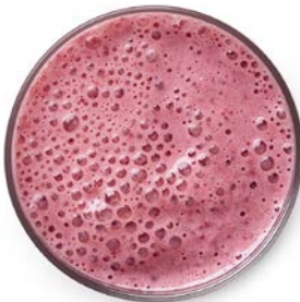
DAIRY PRODUCTS Frozen fruits, seeds & fruit powders, juices, concentrates, sliced dried fruits and purees