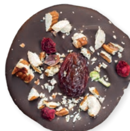
CONFECTIONERY & CHOCOLATE Whole & sliced dried fruits, concentrates, juices, seeds & fruit powders and purees