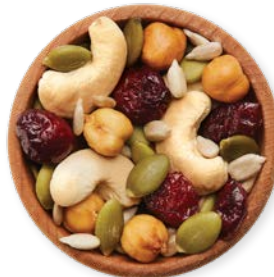
SNACKS Whole & sliced dried fruits and seeds & fruit powders