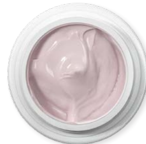
COSMETICS & NUTRACEUTICALS Oil and seeds & fruit powders