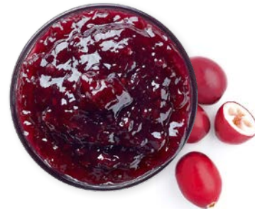
JAMS & SAUCES Concentrates, juices, purees, and frozen fruits