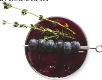
BEVERAGES Concentrates, juices, purees, and seeds & fruit powders