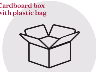
Cardboard box with plastic bag

Dried fruits: 4.54 kg (10 lb) / 10 kg (22 lb) / 11.34 kg (25 lb) Seeds & powders and dehydrated fruits: 4 kg (8.82 lb) / 6.5 kg (14.33 lb) / 10 kg (22 lb) / 15 kg (33.07 lb) Frozen fruits: 9.07 kg (20 lb) / 18.14 kg (40 lb)