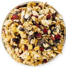
CEREALS & BARS Whole & sliced dried fruits, seeds & fruit powders