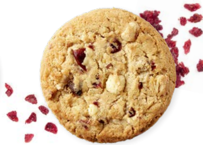
BAKED GOODS Whole & sliced dried fruits, seeds & fruit powders and frozen fruits